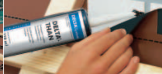
Windproof with DELTA®-FOXX PLUS.