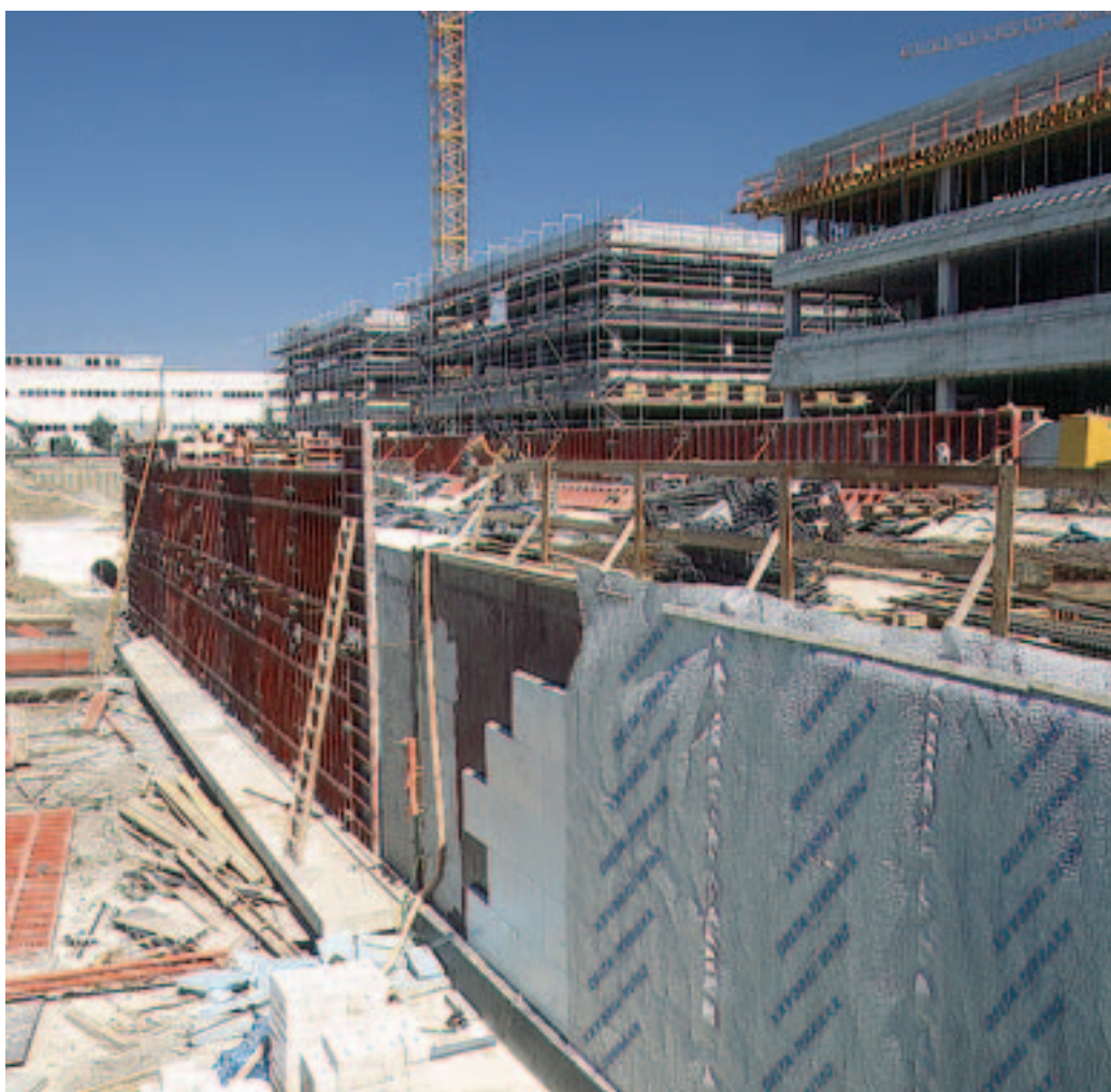
Maximum security when installed on perimeter insulation boards.